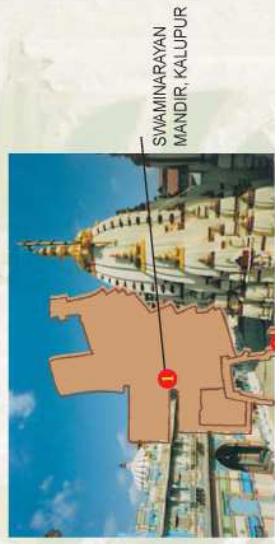
SWAMINARAYAN MANDIR, KALUPUR