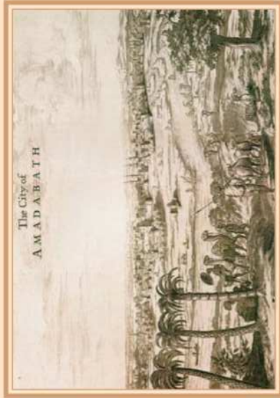
Ahmedabad in 1672 by Philip Baldaeus

On the ancient site of Ashaval and Karnawati, Ahmedabad was founded in 1411. It has some of the finest Indian Islamic monuments and exquisite Hindu and Jain temples. Its carved wooden houses are another unique architectural tradition.